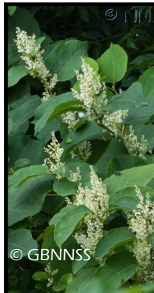
Japanese knotweed flowers