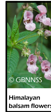
Himalayan balsam flowers

Grows in dense clusters up to 2.5m tall. It is an annual plant found on the banks of slow flowing rivers. Introduced in the 19th century as an ornamental plant, it has orchid-like bright pink flowers between June and October.