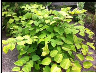
Japanese knotweed growing in a garden

Invasive non-native species are plants and animals that are found outside their natural range and cause harm.