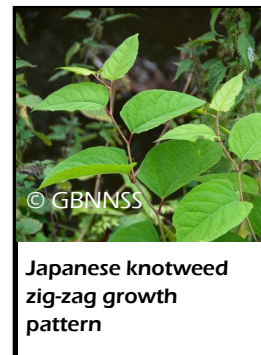
Japanese knotweed zig-zag growth pattern